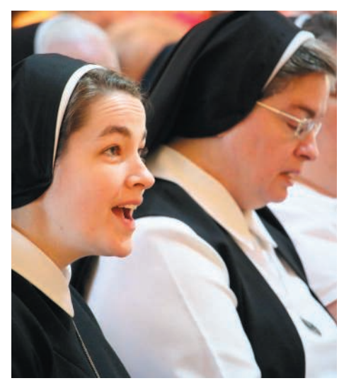
and obedience. For more information, please see the Year of Consecrated Life Website at: http://newarkyearforconsecratedlife.weebly.com/

Since 1997, the universal Church has celebrated the World Day for Consecrated Life. On Tuesday, February 2<sup>nd</sup> in the Cathedral Basilica at 7:30 pm on the Feast of the Presentation of the Lord the Archdiocese will observe this day with a special emphasis on the call to consecrated life in today's world. This Feast is also known as Candlemas Day; the day on which candles are blessed symbolizing Christ who is the light of the world. So too, those in consecrated life are called to reflect the light of Jesus Christ to all peoples. Come join us in joyful prayer! The consecrated life is one way that men and women live out their baptismal commitment as followers of Jesus. Some become members of a religious congregation or a secular institute. Others remain single and make a profession to God through the local bishop and are known as consecrated virgins. We recognize and give thanks for those who have consecrated their lives to God and the Church through the vows of poverty, chastity,