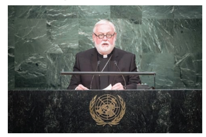
Archbishop Paul Gallagher at the United Nations (Sept 29, 2015)

While these goals are crucial for the future of our world, the success of the MDGs has been limited. While some nations have improved on, or accomplished their specific targets, many nations have been unable to meet any of the goals. As a result, the United Nations began discussing why some places were unable to meet the goals, and reassessed the way in which the goals would be addressed. These reassessments resulted in new, post-2015 Sustainable Development Goals, which were adopted by the UN